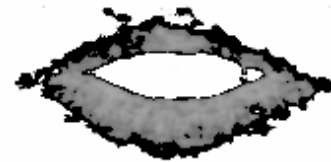
Figure 6 Lips pixels segmentation for hysteresis parameters \gamma_l=0.5 , \gamma_u=1.2 and applied connected component algorithm.

As we can see, simple lips pixels segmentation gives lots of small noisy blobs. To remove them we have applied a connected components algorithm [5]. The algorithm allows to localize all blobs and their size measured by the amount of the black pixels. The lips are supposed to be the biggest connected components, so all smaller blobs are removed. The result of such operation is illustrated in the Fig. 6.