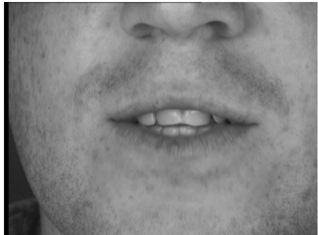
Figure 1 Example of source image.

picture taken from a video sequence. The example of such picture is shown in in the Fig. 1.