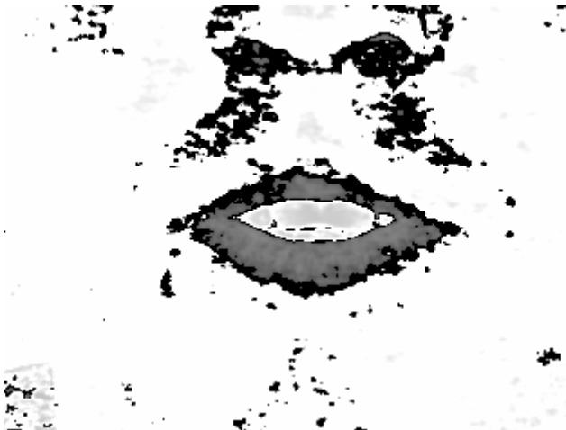
Figure 4 Lips pixels segmentation for hysteresis parameters \gamma_l=0.5 and \gamma_u=1.5 .