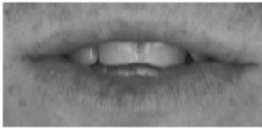
Figure 7 Example of segmented viseme.

Performing connected components algorithm gives us an image with clear selected area of lips. In that case is easy to find the required viseme rectangle (see Fig. 7).