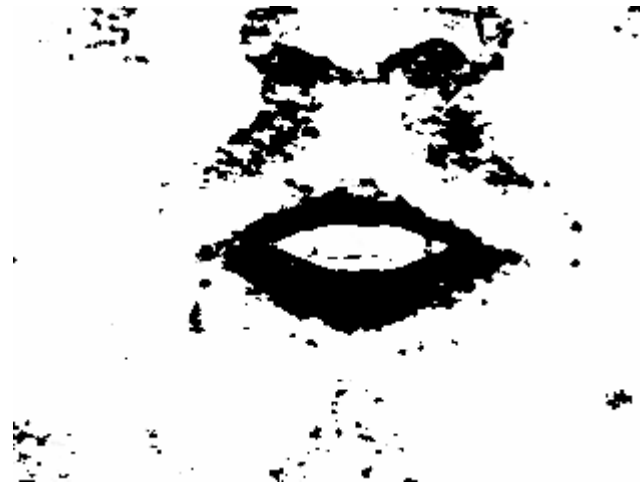
Figure 5 Lips pixels segmentation for hysteresis parameters \gamma_l=0.8 and \gamma_u=1.2 .